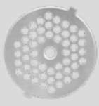
5mm Perforated disc