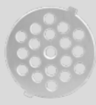
7mm Perforated disc