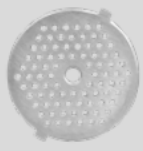
3mm Perforated disc