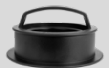
Burger press—2 sizes for filled patties